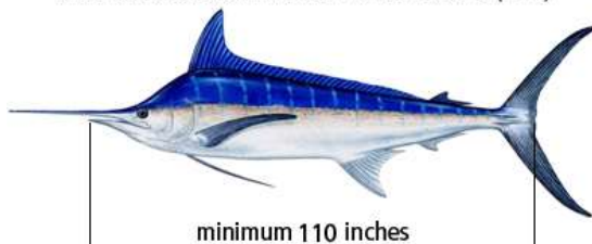
BLUE MARLIN LOWER JAW FORK LENGTH (LJFL)